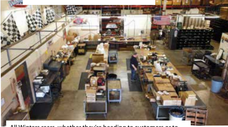
All Winters rears, whether they're heading to customers or to Winters' expansive dealer network, are checked one last time here in the shipping department before they leave the building.