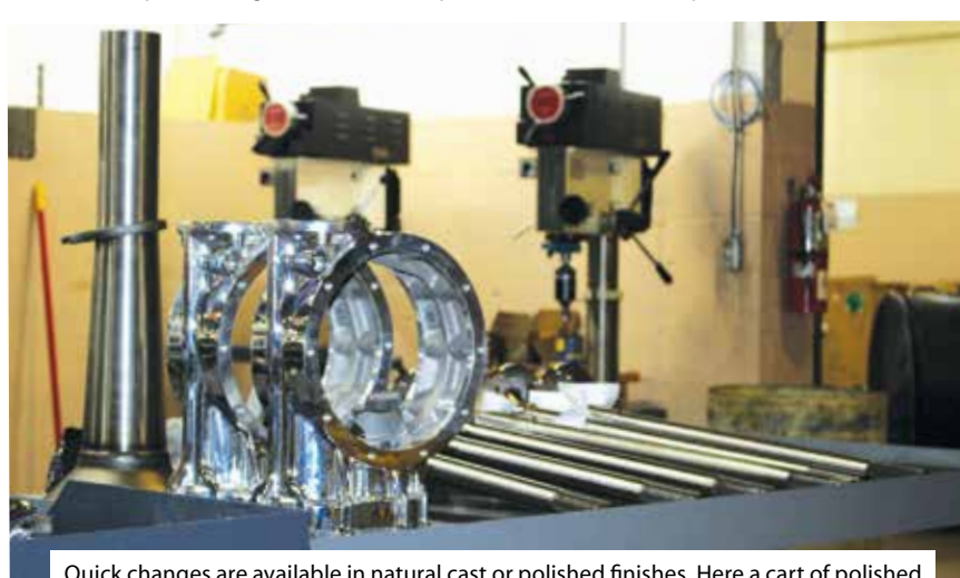
Quick changes are available in natural cast or polished finishes. Here a cart of polished center sections, tapered steel tubes and bells, and axles await final assembly