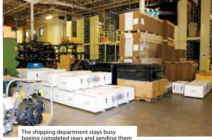
The shipping department stays busy boxing completed rears and sending them to their final destinations around the world.