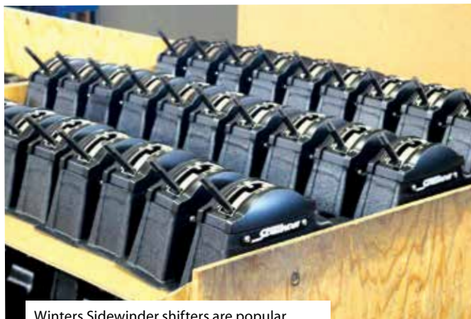
Winters Sidewinder shifters are popular among all manner of performance motorsports, from rock crawlers and other off-road vehicles to hot rods and muscle cars