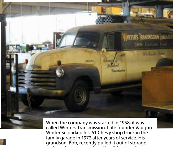
and is in the process of putting it back on the road.