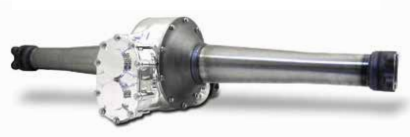
Perhaps the most popular rear among hot rodders is the Steel Tube and Bell V8 Quick Change. It features an 8-3/8" 3.78 ring and pinion, Winters Wedgelock differential, 6-spline spur gears in the customer's choice of ratio, and original Ford-style tapered steel tubes and bells. V8 Quick Changes are rated up to about 600 horsepower.