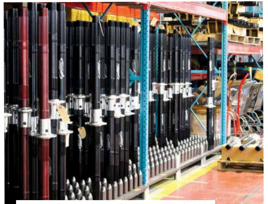
Winters manufactures a wide range of driveline components for the dirt and asphalt racing world. These are palettes of live axles for Sprint cars.