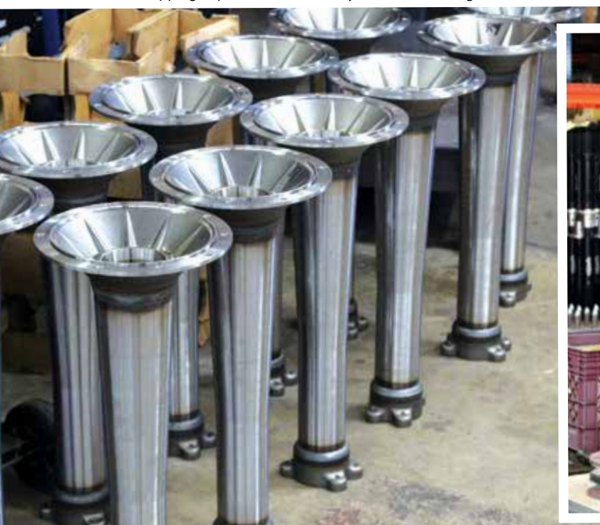
Tapered steel tubes and bells have been welded and are on their way to be mated with their center sections in the assembly department.