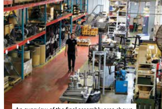
An overview of the final assembly area shows a variety of street and racing rears in process.