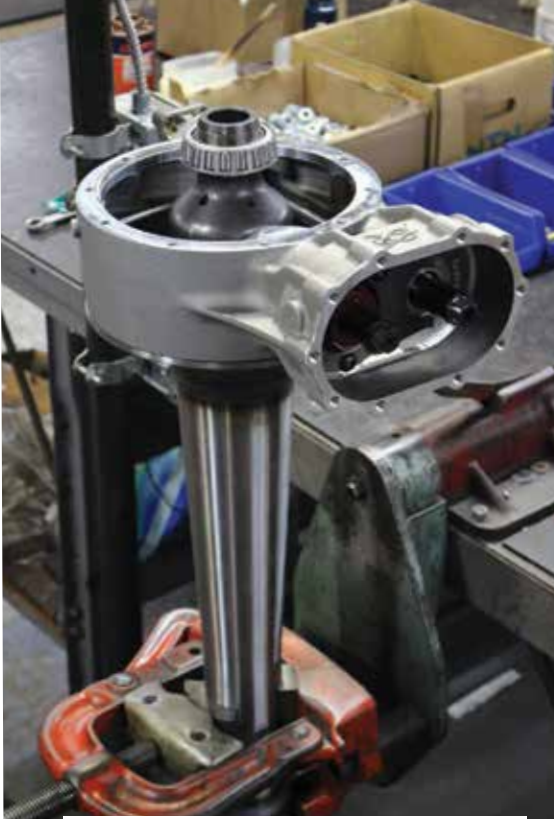
Halfway through final assembly, this Steel Tube & Bell V8 Quick Change already has its Wedgelock