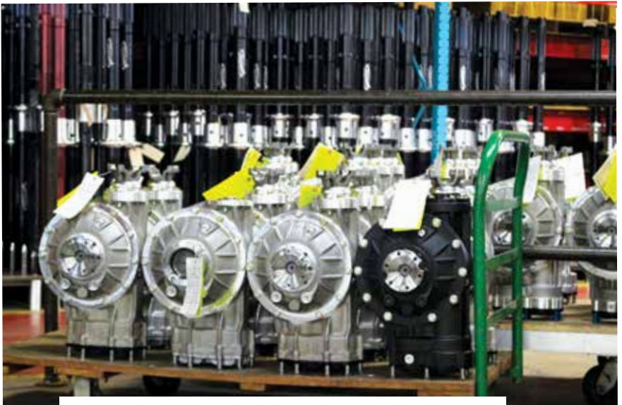
Completed Independent Quick Changes in natural cast and thermal dispersant-coated finishes are bound for the shipping department.

For hot rodders, the two most popular rears Winters makes are the V8 Quick Change, which has an 8-3/8" 3.78 ring and pinion, and the larger Champ Ouick Change, with its 10" 4.12 ring and pinion. The V8 rear is rated to handle up to 550 horsepower, and the Champ is